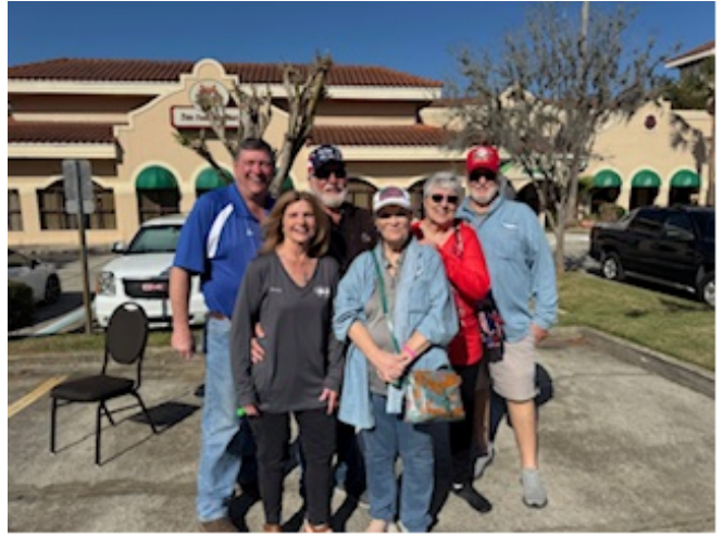
Our Baseball Team